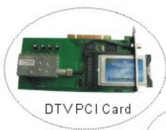
DTV PCI Card